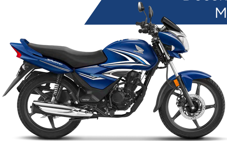
Decent Blue Metallic